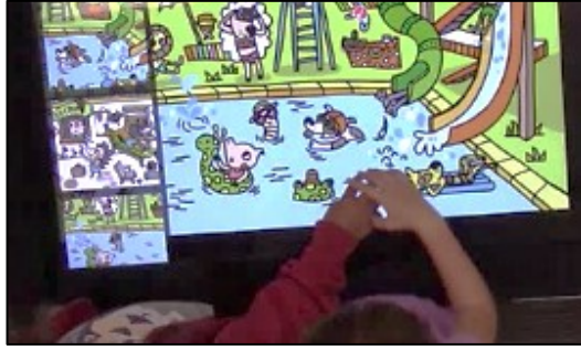
Fig. 6. Example of Ava nudging Sophia's hand out of the way of the big picture.

Ava: "What is missing from this picture? [taps clue image]"