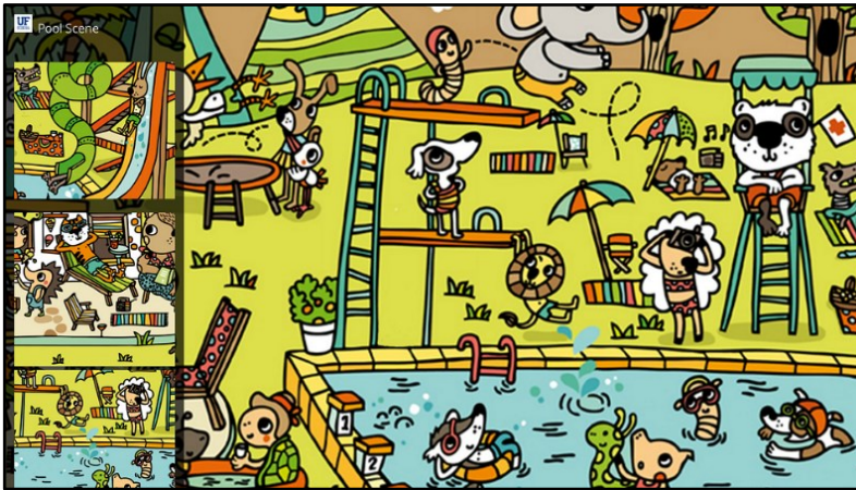
Fig. 1. Screenshot of our I-Spy application showing the pool scene. I-Spy images courtesy of the original artist, Maria Neradova.

While this prior work was effective in examining these specific design suggestions, it might not be beneficial to focus on equity of participation or enforced turn-taking depending on group dynamics [24]. Also, none of the papers that examined specific design recommendations provided a rich analysis of the individual groups, which could have caused distinct collaborative behaviors to be overlooked. The CSCW community has recommended territoriality [28] and enforced turn-taking [21] for collaborative tabletop applications, but the recommendations have not been evaluated to examine whether they decrease children’s negative collaborative behaviors. By separating roles, we take advantage of shared physical space and territoriality, while trying to encourage collaboration without the rigidity of enforced turn-taking.