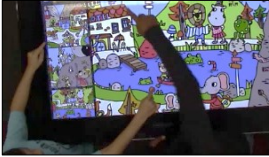
Fig. 5. Example of Ben claiming the current clue image while also interacting with the big picture.

items, not always in their assigned areas. For example, Ben commonly held his finger next to the current clue image while reaching over Victoria to use his other hand to interact with the big picture (Fig. 5). Both Victoria and Ben focused on the task; however, there was not a lot of discussion between the two—they mainly worked independently. Victoria sometimes repeated and copied Ben’s behavior during the task, by repeating the same sentence or gesture (e.g., tapping the same item in the big picture right after him). The pair found 12 missing items, and although Ben was in charge of the clues, he tapped eight of the missing items in the big picture without an explanation to Victoria. During the task, Victoria seemed to get a bit frustrated that Ben was finding most of the items, stating, “ You’re finding literally everything ” to Ben.