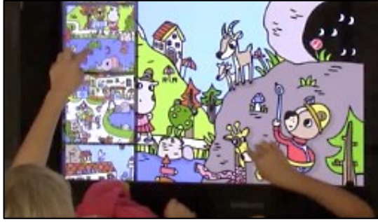
Fig. 4. Emma scrolling to the next clue while Olivia moves the big picture to the new clue location. I-Spy images courtesy of Maria Neradova.

Olivia: “ Oh, we are supposed to do these [pointing to other clue images]? ”